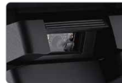
2D Barcode Scanner

Dressed from head to toe in timeless black or white color, the only trend that never goes out of style, and with stylish touches added throughout, the HS-2415W-3A is not just a piece of machinery, it is an elegantly crafted piece of art that looks right at home in any store decoration.