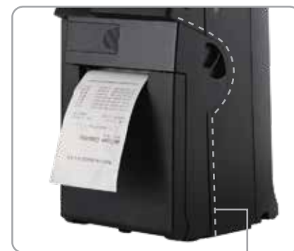
Detachable Receipt Printer

The HS-2415W-3A integrates the most widely used peripherals including 3" thermal printer, MSR, fingerprint sensor, 2D barcode scanner and 2 nd customer display to support your daily POS operation. The detachable modularized design allows quick access to the components, enabling fast and easy service and upgrades.