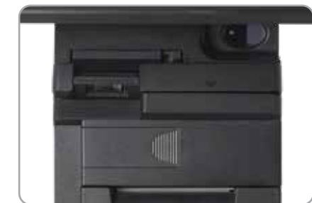
Optional Built-in MSR Fingerprint Sensor and RFID Reader