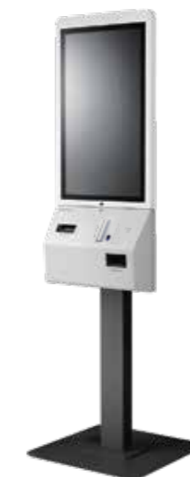
Single Sided Operation