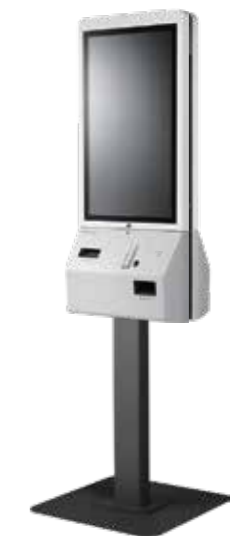
Dual Sided Operation