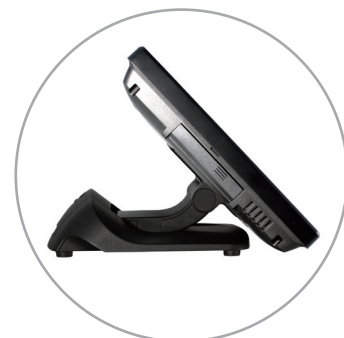
Low Profile Mode