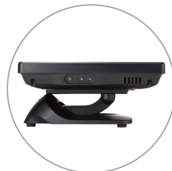
Flat Folded Mode