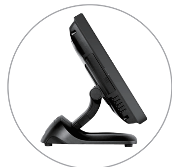
Full Extended Mode

The XT-8315 provide the selection of two foldable bases, the curvy slim GEN7E base and the larger but practical GEN8E base. The foldable base can be configured into "Flat Folded Mode" to save the shipping package volume, "Low Profile Mode" to allow greater interaction between the cashier and the customer, and the traditional "Full Extended Mode". All this can be achieved with a simple pull of the hidden lever.